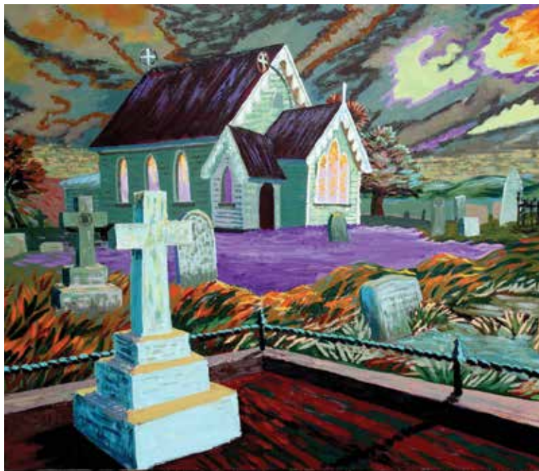
12. Kit Hiller TAS The Angry Church oil on linen 122 x 151 cm $10,000