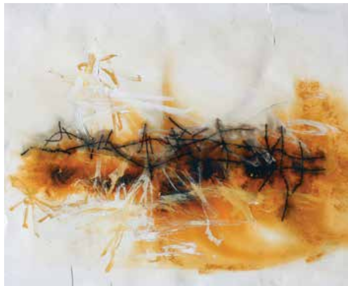
36. Steve Woodbury TAS

Tomorrow's a New Day pastel on paper 60 x 80 cm $2,500