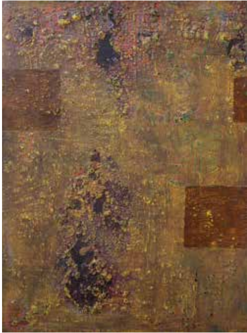
05. Chris Flood TAS

It's a Feeling acrylic on canvas 106 x 79 cm $1,900