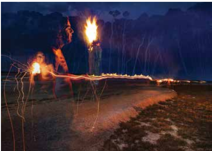
29. Dave manger and Kelly Slater TAS

munjinabitta's Country dye sublimation print on composite aluminium 84.1 x 118.9 cm $1,600