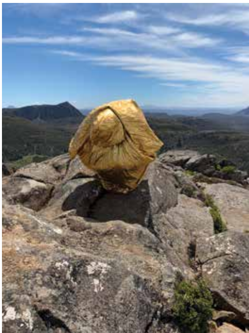
11. Lucy Hawthorne TAS Performing the Abels (Mount Jerusalem) photograph on rag paper 37 x 29 cm $1,500