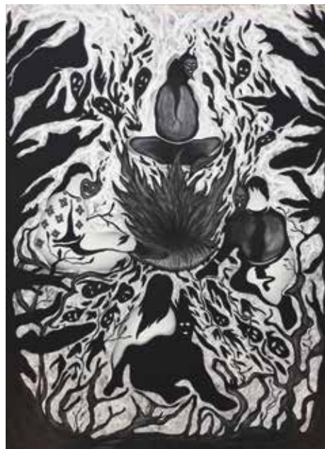
02. Joel Crosswell TAS

pigment print on Canson Platine fibre rag paper 98 x 104 cm $2,200