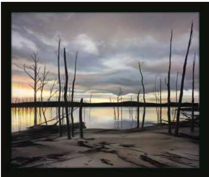
35. Karen Williams TAS

Tomorrow's a New Day pastel on paper 60 x 80 cm $2,500