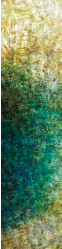
33. Amanda Walker TAS

Of the Sea #1 inkjet print from digital photomontage composite image on archival paper 180 x 60 cm $2,500