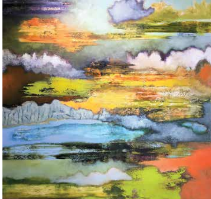
06. Nick Glade-Wright TAS

It's a Feeling acrylic on canvas 106 x 79 cm $1,900