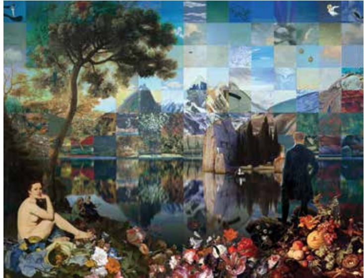
34. Graeme Whittle TAS

Of the Sea #1 inkjet print from digital photomontage composite image on archival paper 180 x 60 cm $2,500