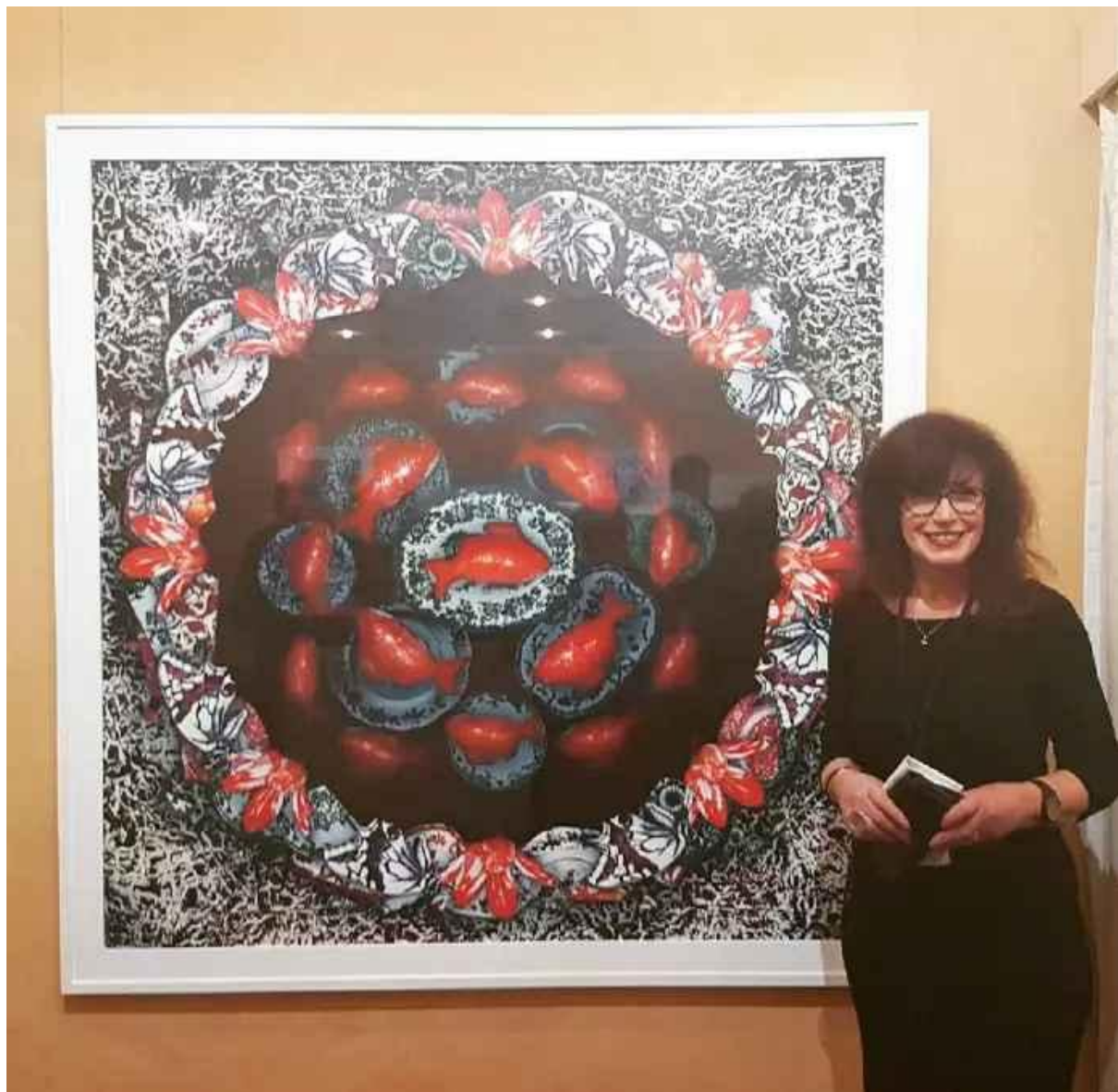
Artist with artwork