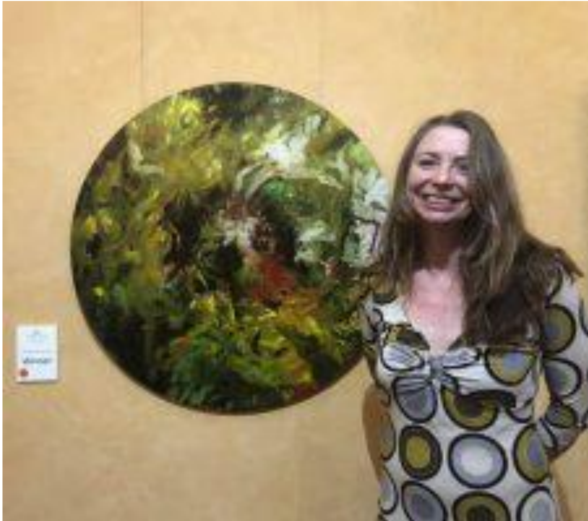
Artist with artwork