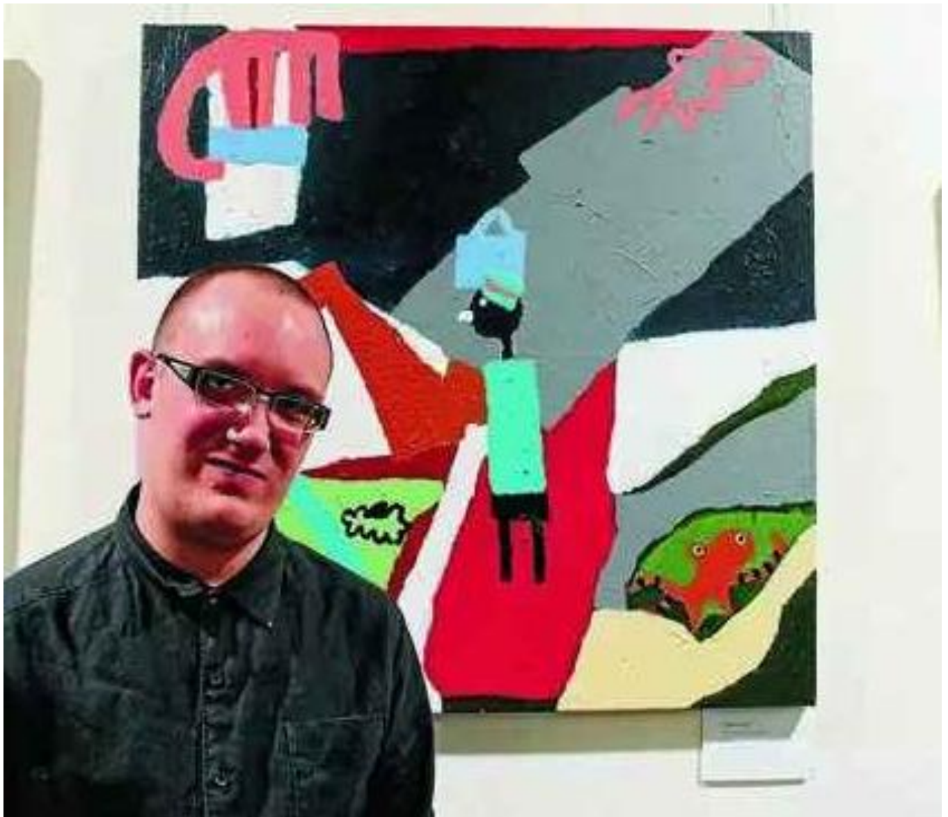
Artist with artwork