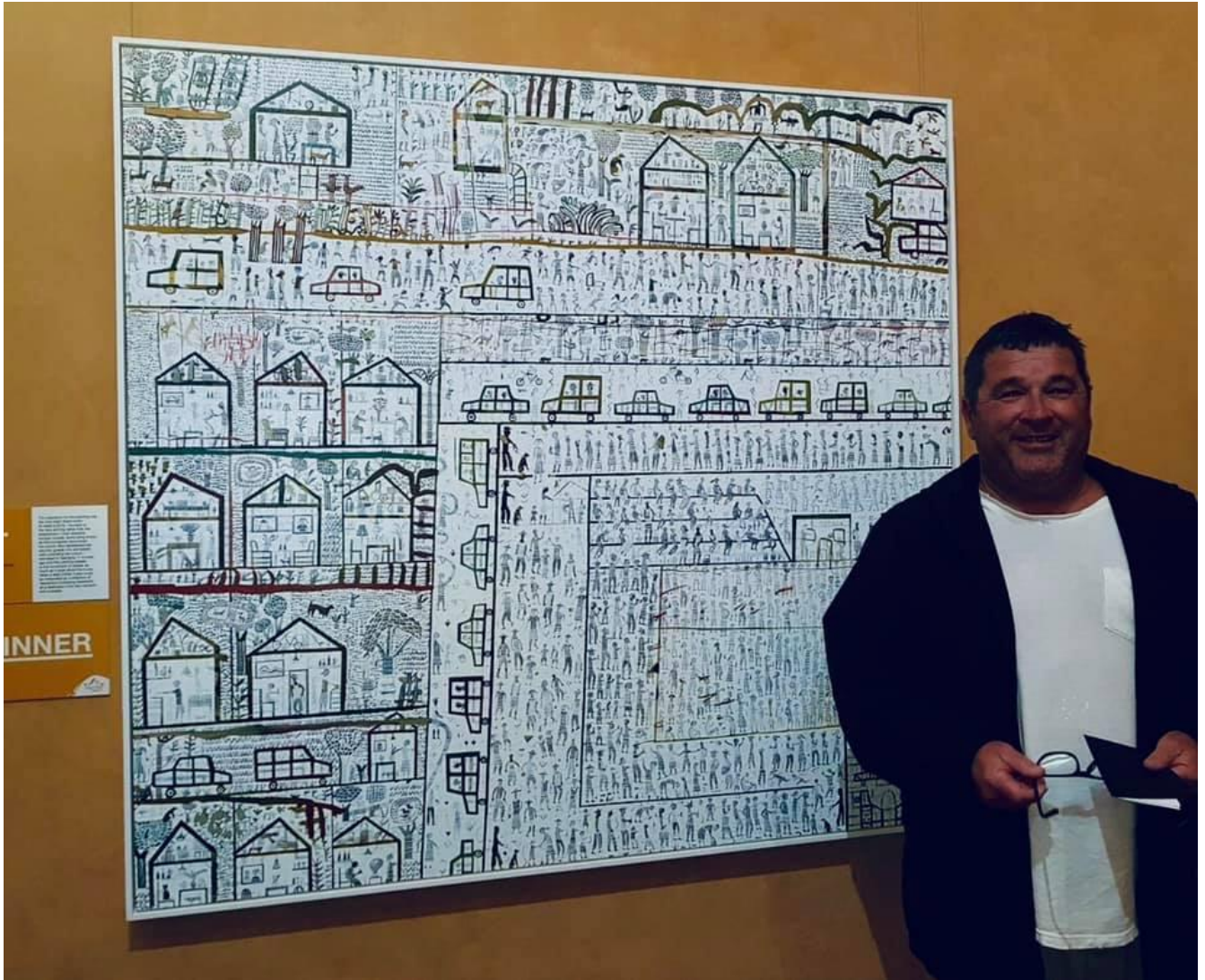
Artist with artwork